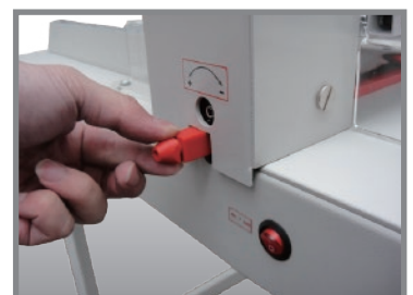
▲ Easy cutting stick change design