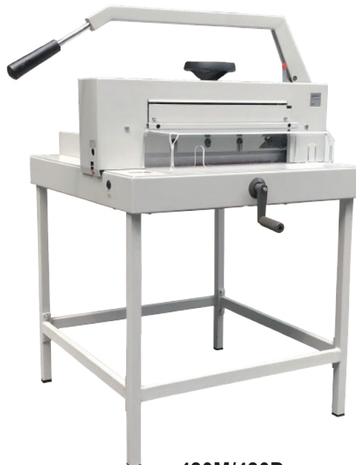
480M/480D Stand: option