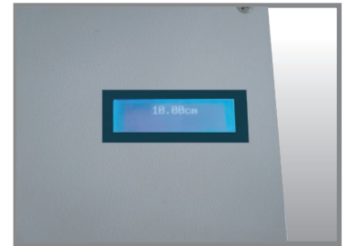
▲ LCD display in mm/inch (430D/480D)