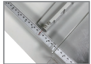
▲ Measuring scale in mm/inch (430M/480M)