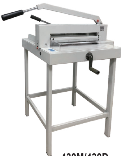
430M/430D Stand: option