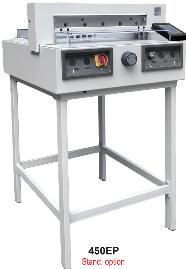
450EP Stand: option