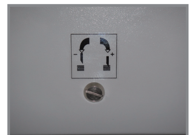
▲ Blade fine-depth can be adjusted from outside of machine & computer control