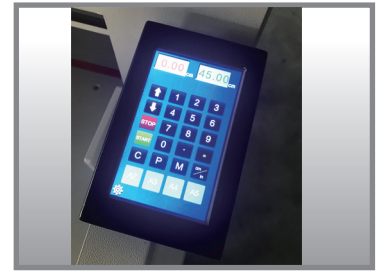
▲ 99 programs with 99 steps each repeat cut function and push out function