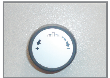
▲ Electronic hand wheel for back-gauge position with variable speed (from very slow to very fast)