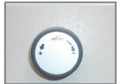
▲ Electronic hand wheel for back-gauge position with variable speed (from very slow to very fast)