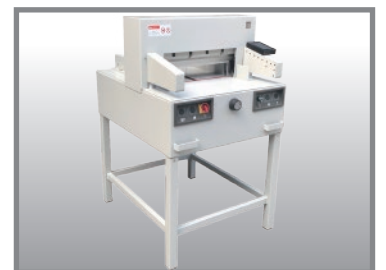
▲ 480EP/650EP without side tables