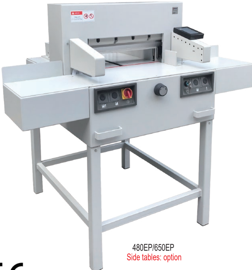
480EP/650EP Side tables: option