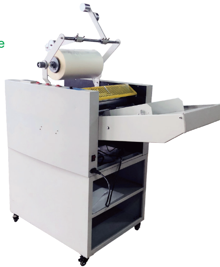
Friction Feeding AUTO-370F / AUTO-490F