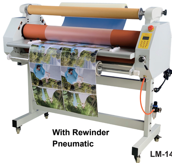
With Rewinder Pneumatic