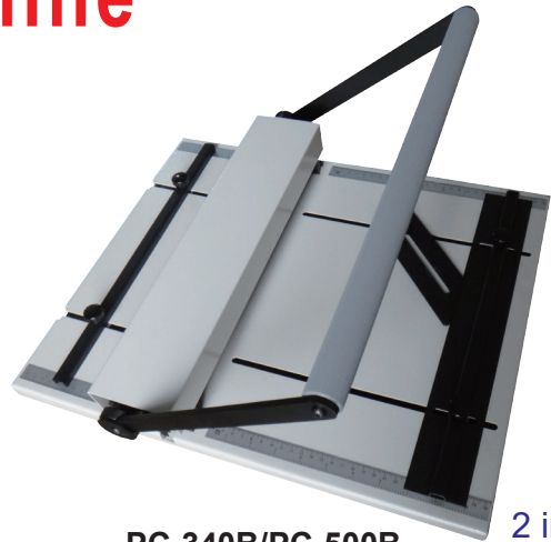
PC-340B/PC-500B 2 in 1 Creasing & Perforating