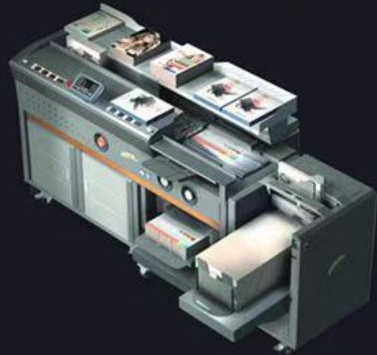
M10 with Book Stacker