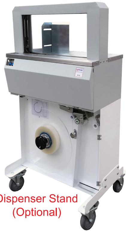
Dispenser Stand (Optional)